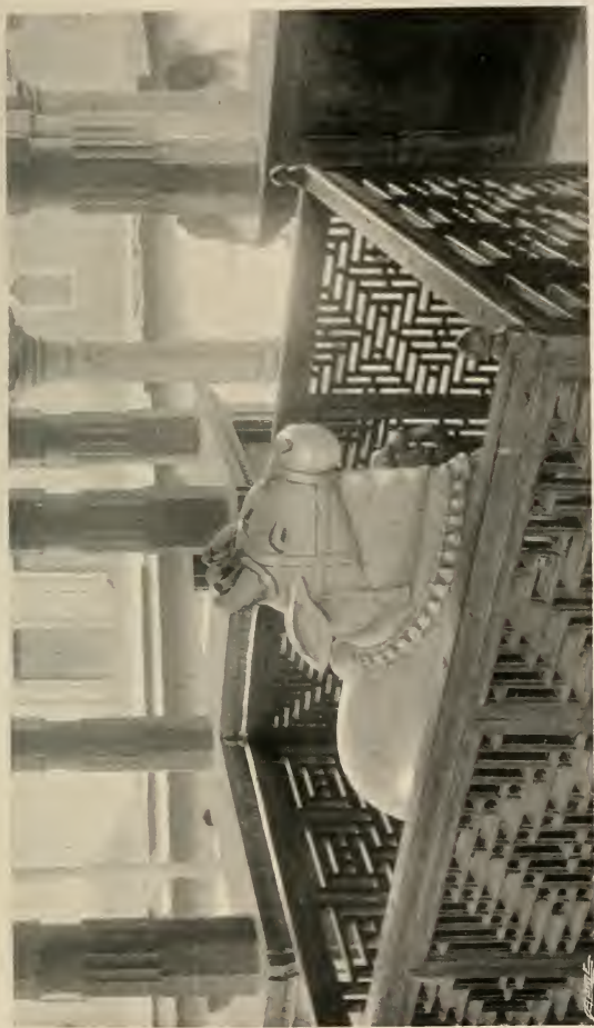
IMAGE OF THE SACRED BULL.